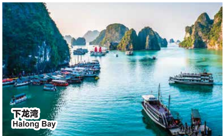
下龙湾 Halong Bay